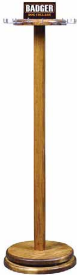
RH1 $40.00 16 peg, 64 dog collars