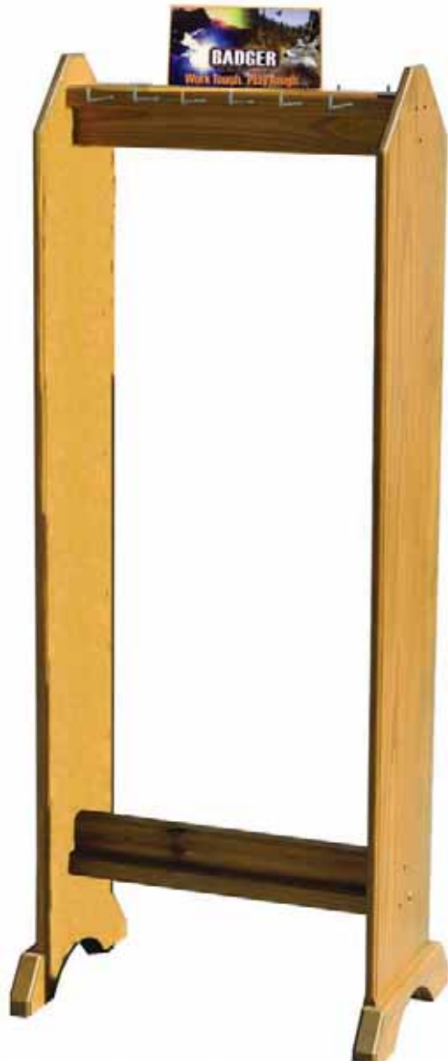
R7 12 peg, 60 belts $100.00