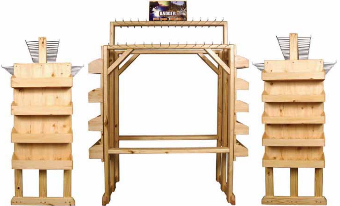
Wallet Attachment 48 wallets