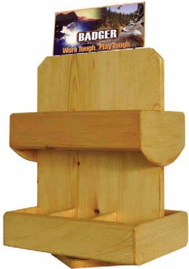
RW3 36 wallets $80.00