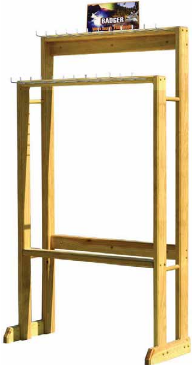
R9 24 peg, 144 belts $125.00

Optional attachments (any combination of 2):