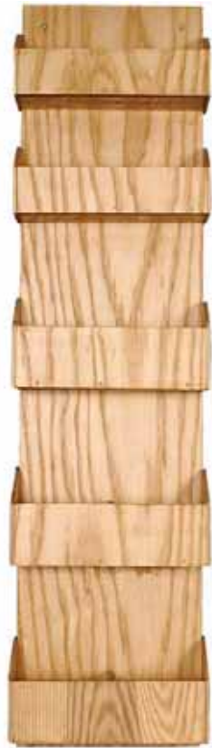
RA1WPH $75.00 Wallet & Phone Holder Attachment 18 wallets, 12 phone holders