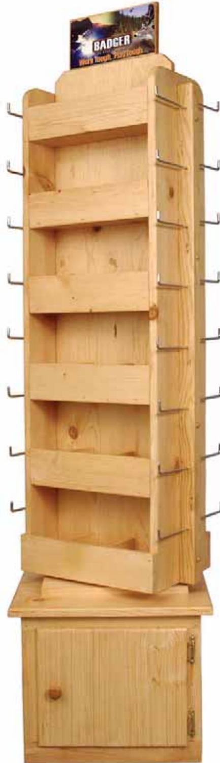
RW4 $300.00 100 wallets, 48 phone holders