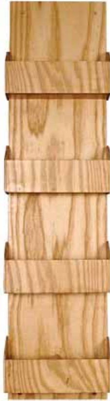
RA1W $75.00 Wallet Attachment 24 wallets