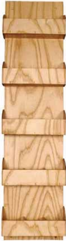
RA1PH $75.00 Phone Holder Attachment 30 phone holders